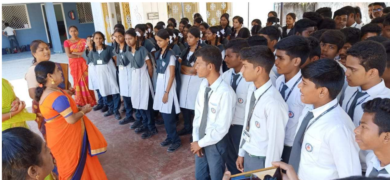
Orientation class to Sabari Nursing Students